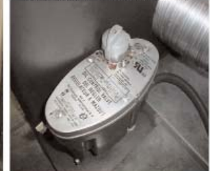
High Quality Components