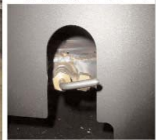
Easy Access De-Scaler

Kuma "Quality and Performance Welded Together"